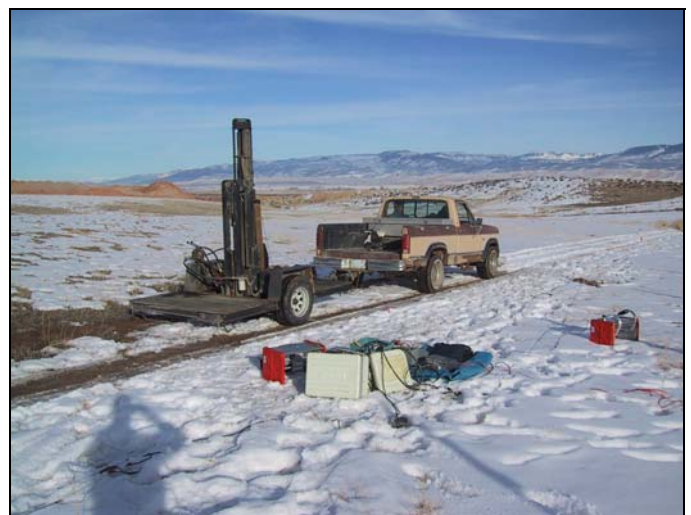
Salt Diapir Delineation, Redmond, Utah