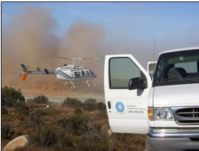
Depth to Bedrock Survey, San Ysidro Mountains, San Diego County, California

SubSurface Surveys, & Associates, Inc (SSS) established in 1988, is a privately owned small business specializing in near-surface geophysics and utility locating services and is dedicated to establishing strong client relationships. SSS extensive education and experience in implementing state-of-the-art techniques allows for a more comprehensive approach to solving complex problems through cost-effective means.